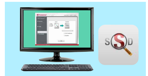
SSD Scope software for system clone