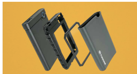
Shock absorbing rubber for rugged protection