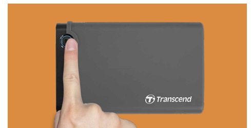
One touch for easy backup

*SSD Scope is available for system clone.