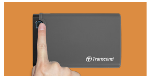
One touch for easy backup