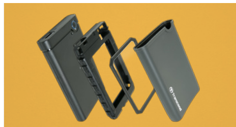
Shock absorbing rubber for rugged protection