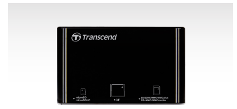
Clearly labeled slots