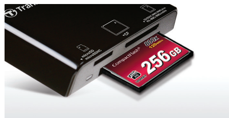
Supports CompactFlash cards

Compliant with the USB 2.0 specifications, Transcend's RDP8 all-in-one multi-card reader guarantees incredible speeds and compatibility even when reading high-speed memory cards. Other major features include rounded handy design on two sides, clear slot labels, and a bright LED indicator showing card insertion and data transfer.