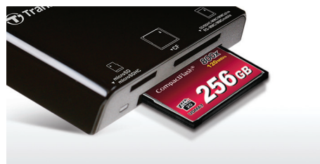
Supports CompactFlash cards

Compliant with the USB 2.0 specifications, Transcend's RDP8 all-in-one multi-card reader guarantees incredible speeds and compatibility even when reading high-speed memory cards. Other major features include rounded handy design on two sides, clear slot labels, and a bright LED indicator showing card insertion and data transfer.